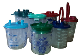
Cradle support for AME reusable cannisters and various liner systems including Serres, Vac sax, Cardinal Health, FloVac, MTP and others.