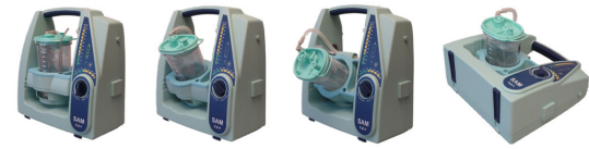
The AME e.p.s - Revolutionary in design