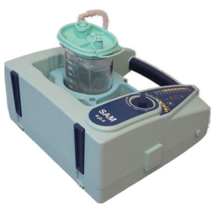
Rotating bottle for stable positioning on uneven surfaces