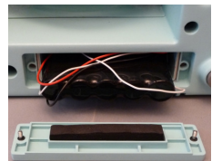
Simple battery replacement