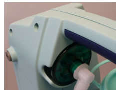
Easy release Hydrophobic filter and 'softgrip' carry handle.