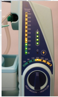
Clear digital display with single large vacuum control knob

It's not just in operation that the e.p.s excels. For simple cleaning, the unit has a wipe down display and a removable bottle cradle. And to aid maintenance and support, there is a service indication light, an easy access battery for fast replacement and the ability to download usage data to assess how much the unit is actually being used.