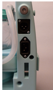
Internal on-board charger capable of running directly from AC and DC supplies.